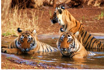
Ranthambore National Park