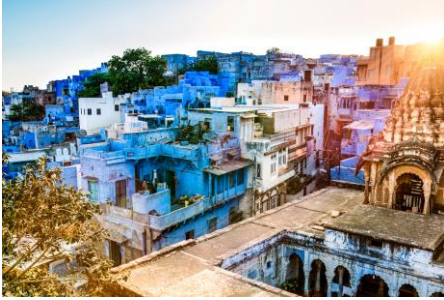
Jodhpur – India's Blue City