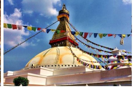
Boudhanath Stupa, Nepal